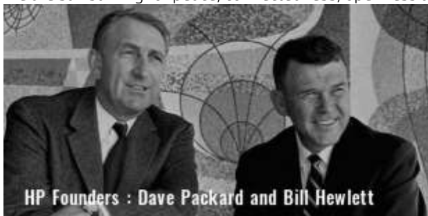
HP Founders : Dave Packard and Bill Hewlett

We are still striving for peace, connectedness, openness and transparency in life...so somethings have not